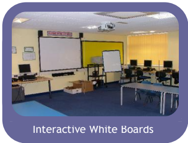
Interactive White Boards

Fully specified, installed and tested interactive whiteboard solutions: