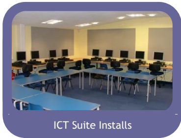
ICT Suite Installs

Datasol offer a full range of ICT solutions including all of your cabling requirements and electrical work: